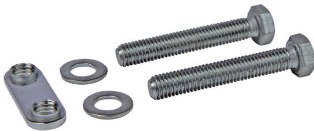
Plate nut set, 3 pieces M6, DN 40 CF