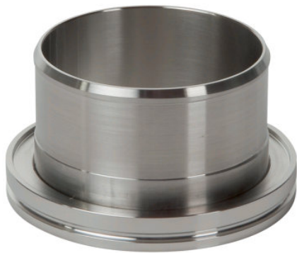
Hose adapter, stainless steel, DN 100 ISO-K