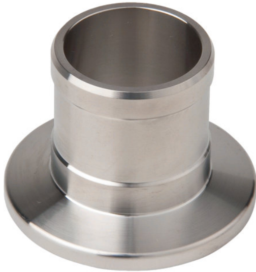
Hose adapter, stainless steel, DN 50 ISO-KF