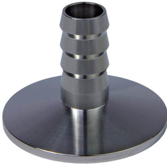
Hose connector, stainless steel, DN 25 ISO-KF