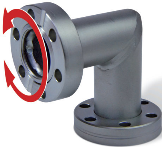
Elbow fitting, stainless steel 304L, DN 63 CF